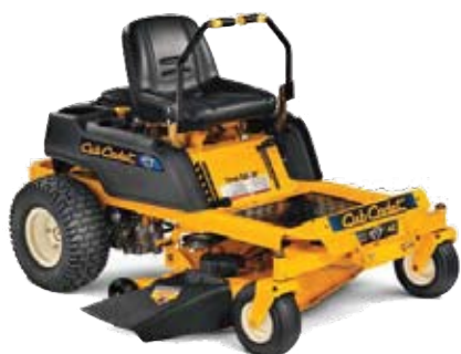
RZT Zero Turn