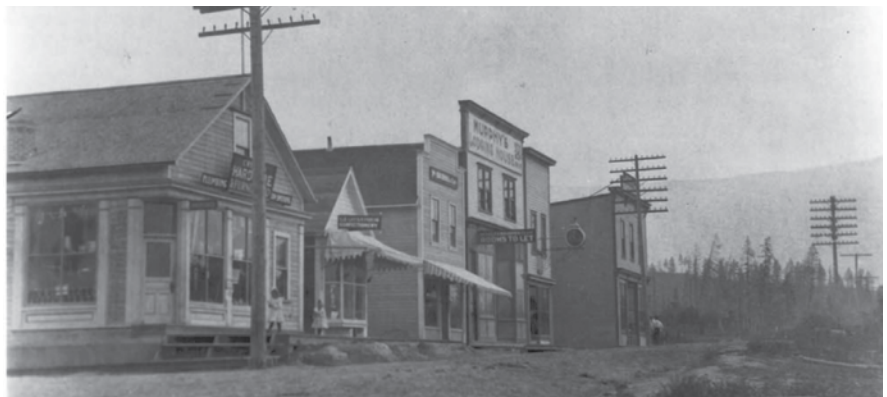
Canyon Street, showing Murphy's boarding house. This photo was taken sometime after July 1909 - the clock was installed on the front of Howarth's Jewellery Store that month - but before the Bank of Commerce (Jordan's Financial Block) was built in 1911. The last building on the street - two doors up from Murphy's - is now the Advance.