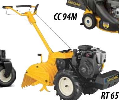
RT 65 Tiller