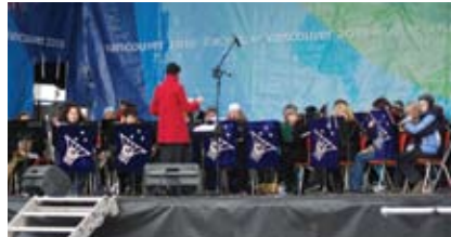
Creston Community Band joined with their friends from the Kimberley Community Band at the recent Olympic Torch Relay Celebration in Creston.