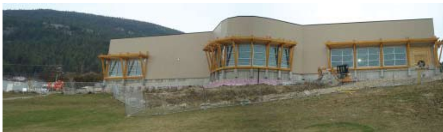
Creston & District Community Complex.

This project is funded by The Canada-British Columbia Municipal Rural Infrastructure Fund, the residents of the Creston Valley and donations.