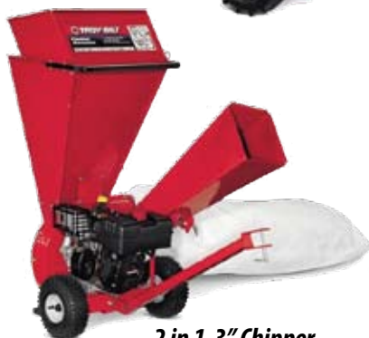
2 in 1 3" Chipper